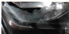
Lens Fog build up

Manufactures note: Condensation is a common problem that all car light manufacturers encounter. As climate changes, the humidity in the headlights can cause the fog. Once the headlights are turned on, the heat produced from the bulb will cause condensation.