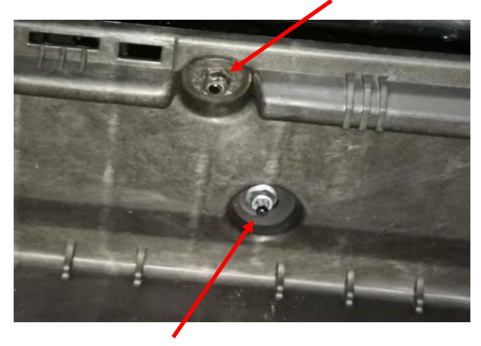
Install metal nuts in the lower row